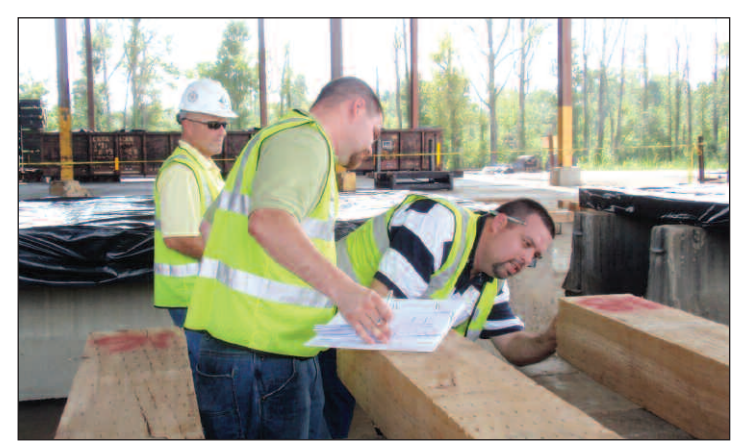
Ties must not only be graded...