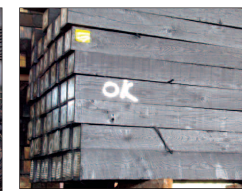
Then, the ties are stored under cover until they...