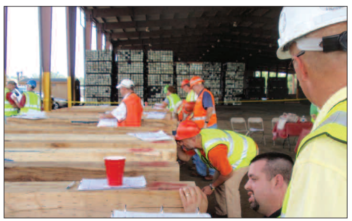
...but all species must be accurately identified.