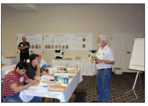
...and Conners goes through the terminology and differences between hardwoods and softwoods and then the individual species.