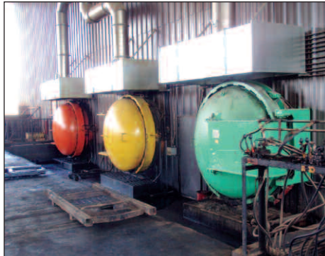
...and treated either with creosote alone or with a dual borate/creosote process