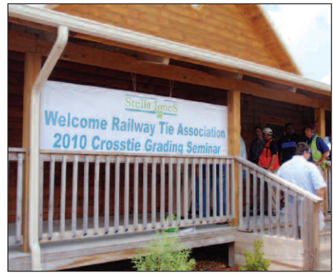
Then, it's back to the field where the red carpet and a fantastic barbecue lunch was rolled out by our hosts, Stella-Jones.